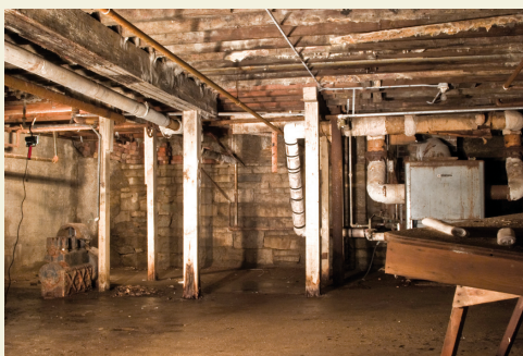
Asbestos wraps most of the pipes in the basement.

Before we begin work in the basement, the asbestos must be